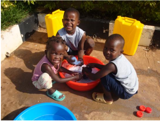
The children learning to hand wash their clothes.